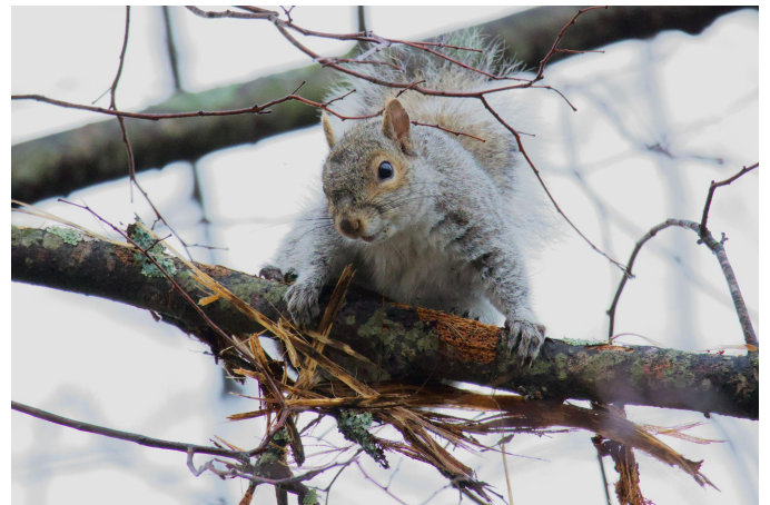
A local squirrel working hard on a spring nest