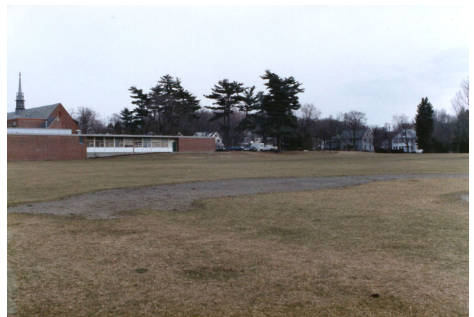
Hamilton Park in the 1980s.

Instead, neighbors just started planting. And we've had fun doing it. It makes me really happy to live here.